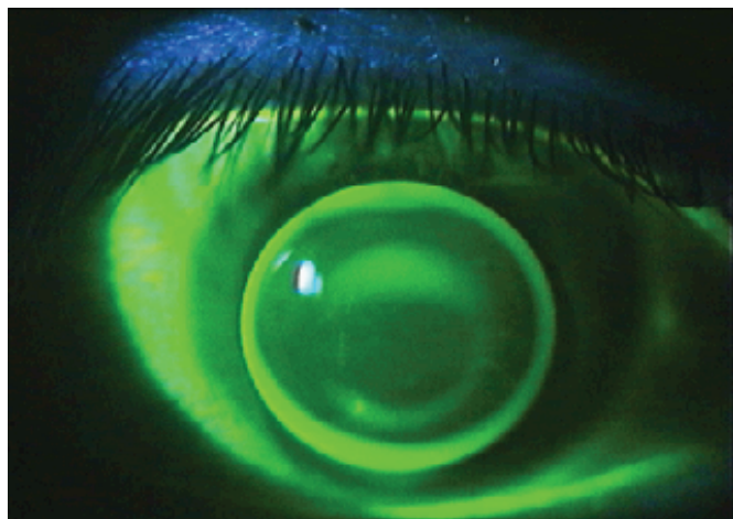
Base Curve 6.40 0.4mm flatter than ideal. Excessive pressure on cone.